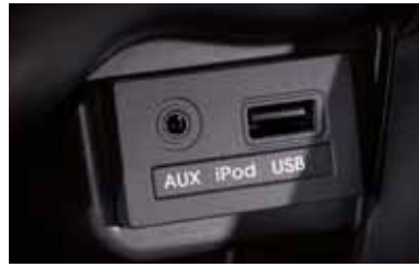
Aux and USB Ports