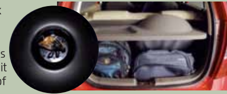
Tank capacity (water filling) – 34 litres

The company fitted Toroidal LPG tank is specially designed and is smartly located so that it does not use up much of the useful boot space.