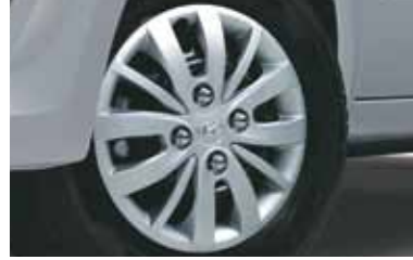
Full Wheel Cover

The Next Gen i10 is simply irresistible and speaks volumes about class and innovation from every angle. From the 2 DIN Audio, the Aux & USB ports to the tilt steering and full wheel cover, everything is designed to make the drive more convenient and comfortable.