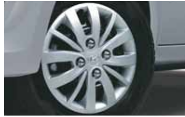
Full Wheel Cover

The Next Gen i10 is simply irresistible and speaks volumes about class and innovation from every angle. From the 2 DIN Audio, the Aux & USB ports to the tilt steering and full wheel cover, everything is designed to make the drive more convenient and comfortable.