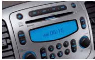
2 DIN Radio+CD+MP3 Audio