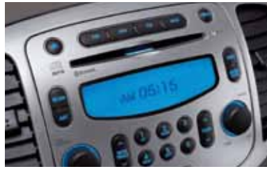
2 DIN Radio+CD+MP3 Audio