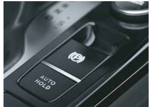
Electric parking brake with auto hold