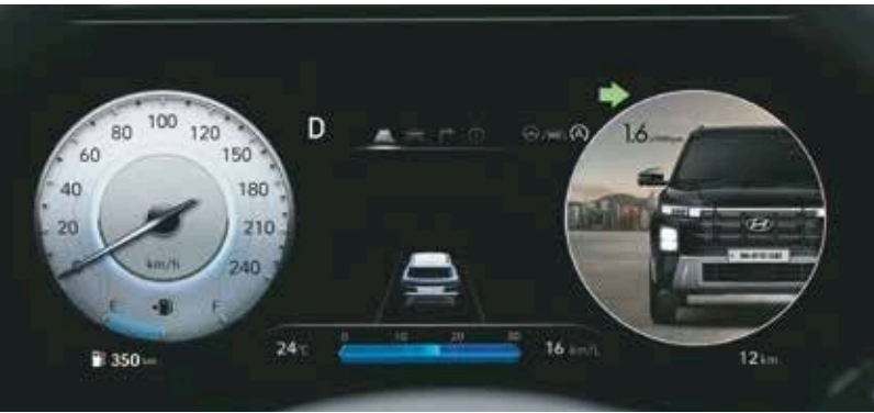
Blind-spot view monitor (BVM)