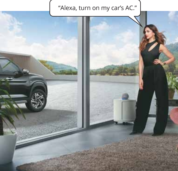
Home to car (H2C) with Alexa

Stand above it all and yet stay completely connected with your world. When it comes to technology, connectivity and infotainment, the new Hyundai CRETA is equipped with the most advanced features. The innovative Hyundai Bluelink app, Home-to-Car with Alexa gives you the power to control your car from the comfort of your home or office.