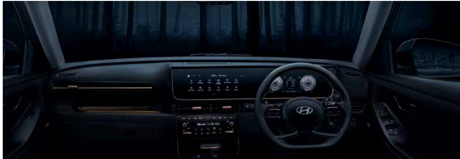
All black interiors with brass coloured inserts.