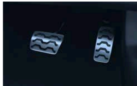
Sporty metal pedals