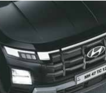
Horizon LED positioning lamps & DRLs