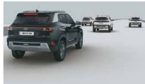
Smart Cruise Control with Stop & Go (SCC with S&G)