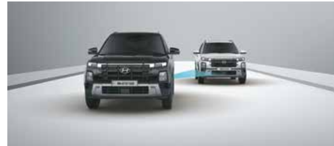
Blind-spot Collision - Avoidance Assist (BCA) & Blind-spot Collision Warning (BCW)