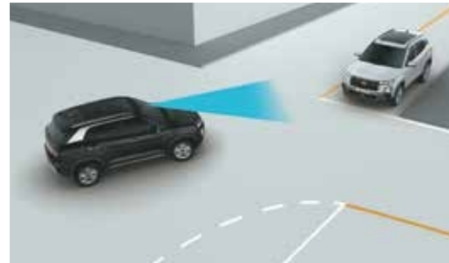
Forward Collision - Avoidance Assist - Junction Turning (FCA-JT)