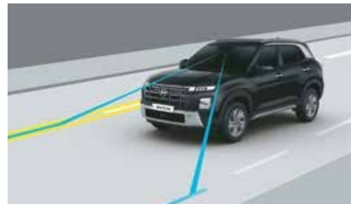
Lane Following Assist (LFA)