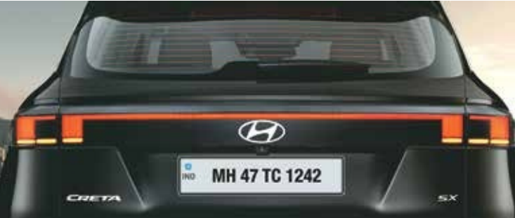
Connecting LED tail lamps