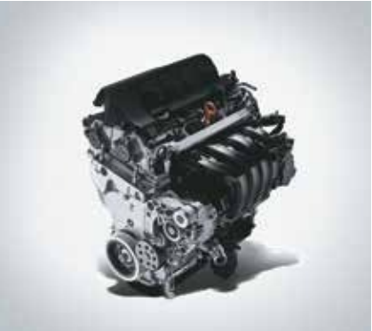
1.5l Petrol [6MT and IVT]

Powerfully distinctive design, impressive dimensions – The new Hyundai CRETA is an ultimate example of what happens when technological vision becomes a reality. It is as intrepid as it is agile. With the 1.5l petrol turbo under the hood, you would never be left wanting for power.