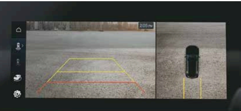
Surround view monitor (SVM)