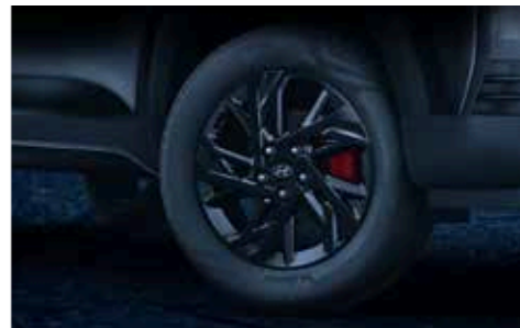
Black alloys with red calipers