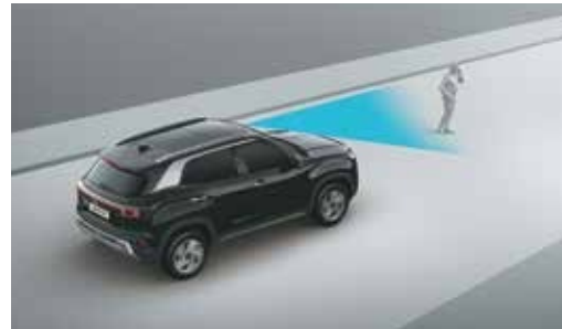
Forward Collision - Avoidance Assist - Pedestrian (FCA-Ped)