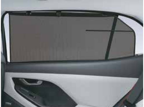
Rear window sunshade