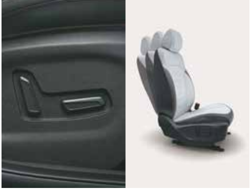
Power driver seat - 8 way

Other features: Driver rear view monitor | Front row ventilated seats | Voice enabled smart panoramic sunroof 60:40 split rear seat with 2-step recline