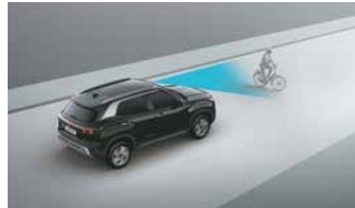
Forward Collision - Avoidance Assist - Cycle (FCA-Cyl)