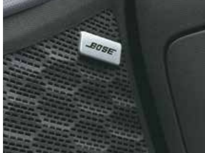
Bose premium sound system (8 speakers)

Other features: USB charger C-Type (Front – 1 and Rear – 2) | Embedded VR commands | In-built music streaming application JioSaavn (with 1 year complimentary subscription)