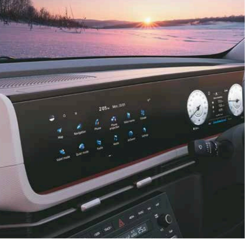
Seamlessly integrated infotainment and cluster screen

Overwhelming presence and discreet glamour. With its symphony of space, the new Hyundai CRETA is a work of art. In the new Hyundai CRETA, every journey is a moving moment – even when stationary. Be it the refined cockpit or the comfortable second row, one always has the best seat. The interior is the soul of the new Hyundai CRETA.