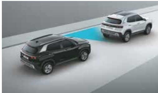
Forward Collision - Avoidance Assist - Car (FCA-Car) & Forward Collision Warning (FCW)