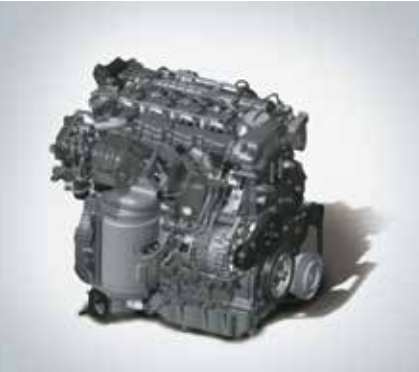
1.5l Diesel [6MT and 6AT]