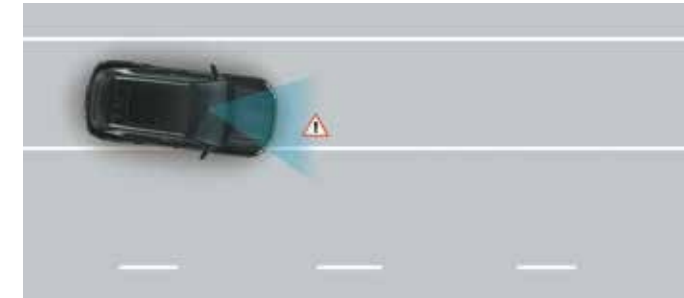
Lane Departure Warning (LDW)