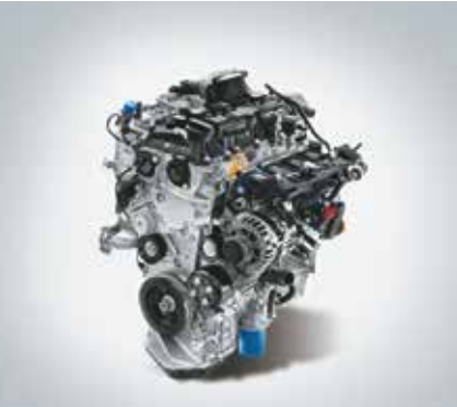
1.5l Petrol turbo [7DCT]