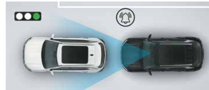
Leading Vehicle Departure Alert (LVDA)