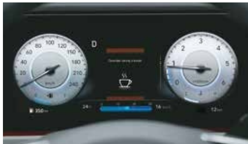
Driver Attention Warning (DAW)

The new Hyundai CRETA is alive with Hyundai SmartSense-Level 2 ADAS. It assists the driver by deploying advanced safety features thereby making the road safe for the passengers and the pedestrians as well. Now you can look forward in a relaxed manner and devote yourself to the most important thing, the pleasure of driving. And let the advanced driver assistance system be your reliable companion that ensures you master every challenge on the road with confidence.