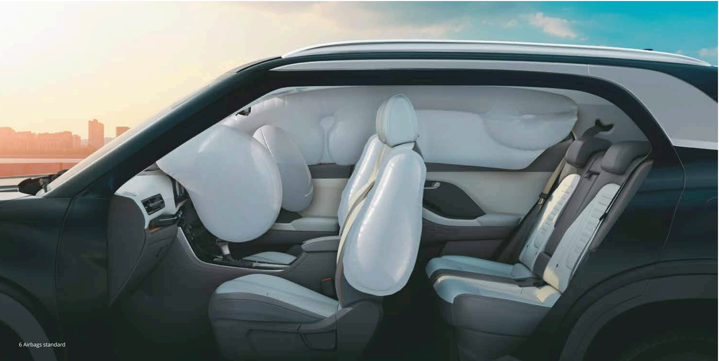
6 Airbags standard