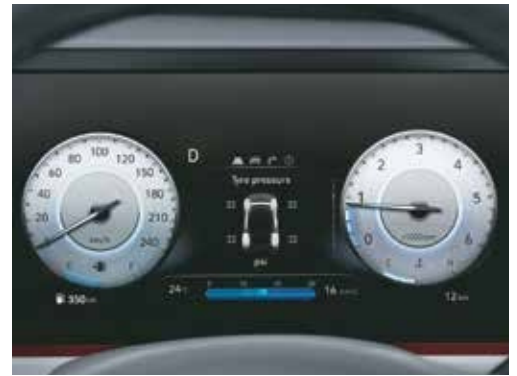
Tyre pressure monitoring system: Highline

Other features: ECM mirror with SOS button | ISOFIX | Front and rear parking sensors