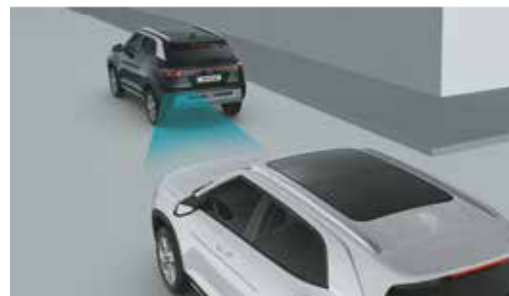
Safe Exit Warning (SEW)