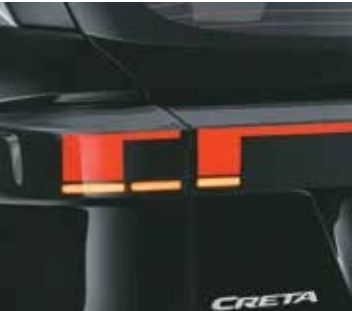
LED rear turn signal with sequential function