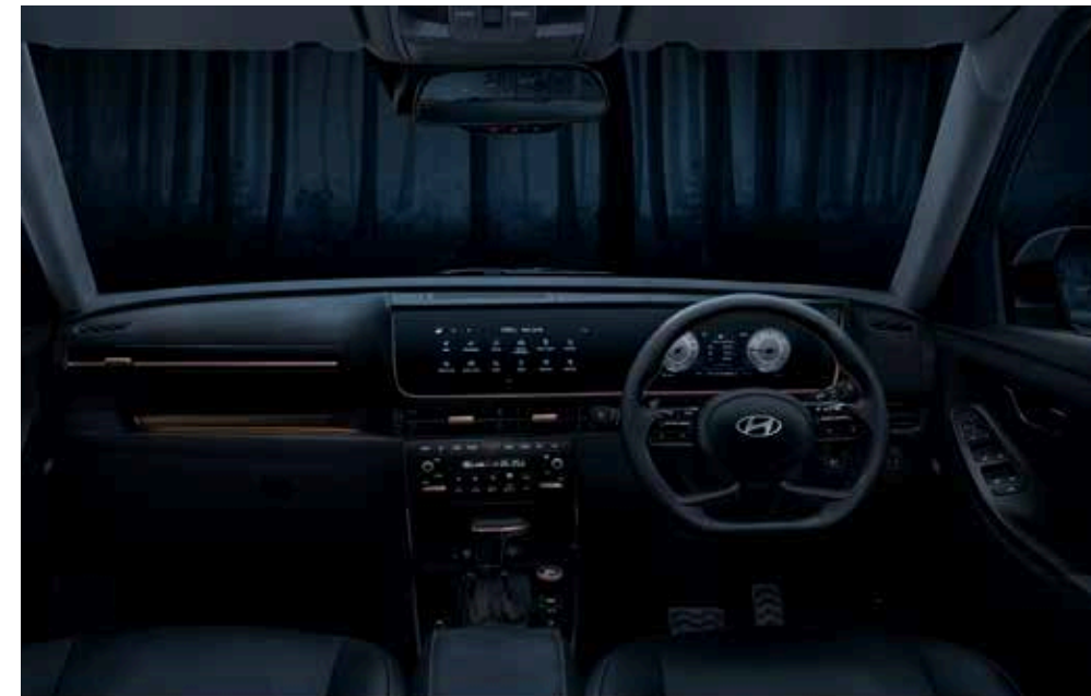
All black interiors with brass coloured inserts

If dark is your style, CRETA Knight will make you fall in love with it at the very first sight. Exuding great style and sophistication, it truly stands out with its all-black exteriors and an equally classy interiors with brass inserts. It combines great looks with legendary performance and lavish comfort. Go for it. Be undisputed. Be ultimate.