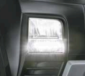
Quad beam LED headlamps