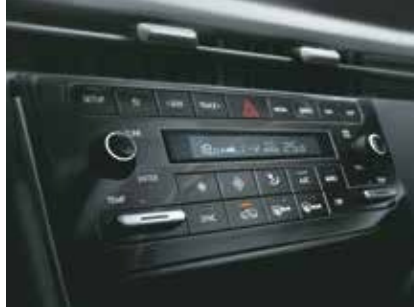
Dual zone automatic temperature control (DATC)