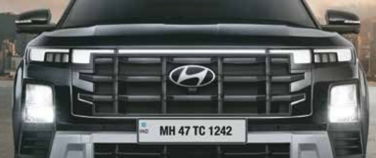
Black chrome parametric radiator grille

Bold. Charismatic. Extraordinary. The new Hyundai CRETA is symbolic of all things impressive no matter how you look at it. Its black chrome parametric grille makes a striking impression. Its new horizon LED positioning lamp & DRLs and quad beam LED headlamps in the front give the SUV an unmistakable presence on the road. The rear profile is also sculpted with refreshingly new elements like the connecting LED tail lamps that announce its departure.