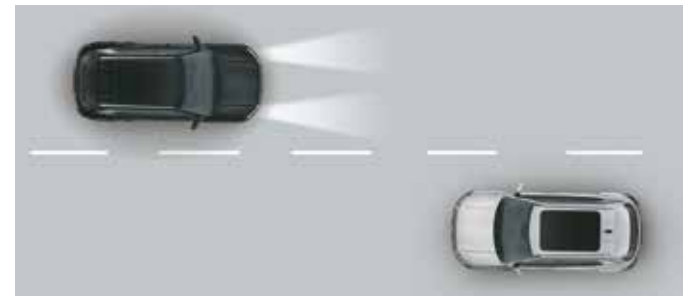
High Beam Assist (HBA)