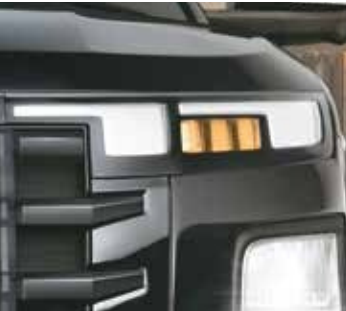
Front turn signal with sequential function

Other features: Puddle lamp with welcome function | Chrome outside door handles | Front & rear skid plate Integrated rear spoiler with LED HMSL (high mounted stop lamp)