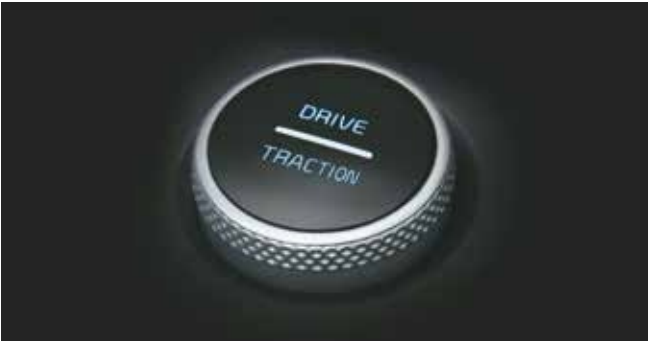
Traction control modes (snow, mud, sand)