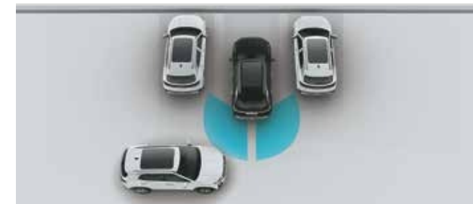
Rear Cross - Traffic Collision - Avoidance Assist (RCCA) & Rear Cross - Traffic Collision Warning (RCCW)