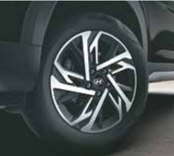
R17 (D=436.6 mm) Diamond cut alloys